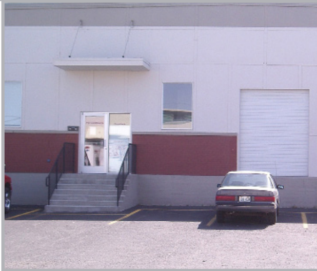
BUILDING 12, SUITE Q